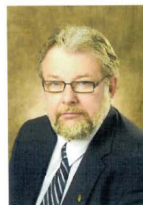
Bill Blaikie Minister of Conservation

A handwritten signature in blue ink, reading "Bill Blaikie".