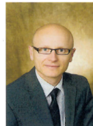
Fred Meier Deputy Minister of Conservation